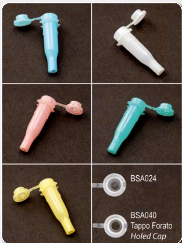
BSA024 Conetti portacampione in PE utilizzabili su Cobas® disponibili in 5 colori. Microtube in PE Utilizable on Cobas®, 5 colours available.