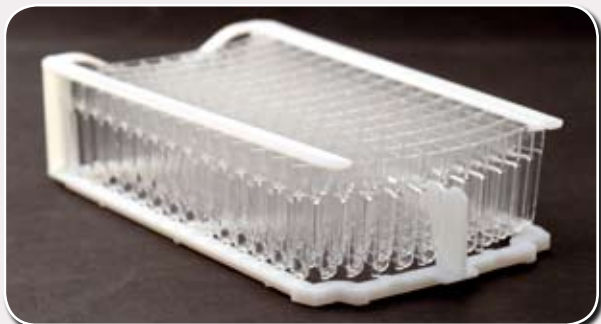
BSA85 Cuvetta a 12 posti su rack in Metacrilato. Multicells Segments in rack, in Methacrylate.